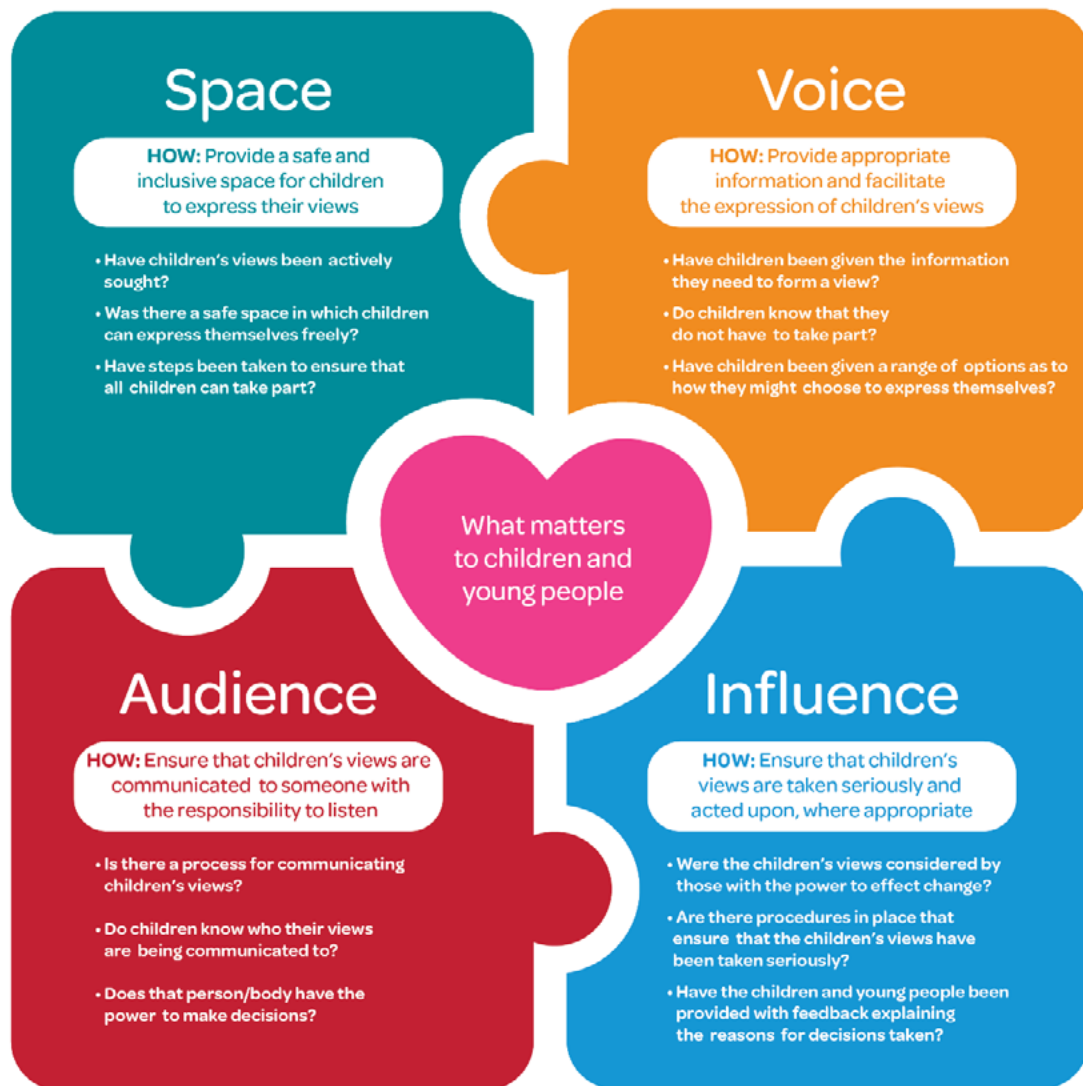
Figure 2: Lundy's Voice Model Checklist for Participation